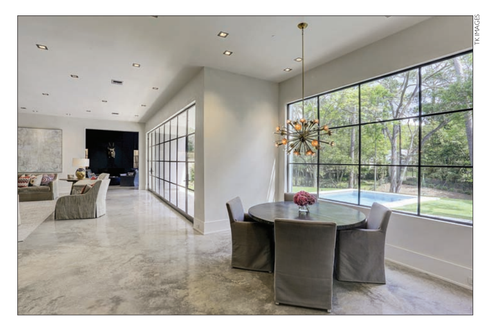
THESE PAGES: Walls of steel-framed windows provide a striking view of the backyard from the living and breakfast room. | A powder room comes alive with striking wallpaper by Osborne Little. Custom vanity from reclaimed wood; Belgian stone sink from AREA; and Jean Bois mirror from Wisteria Home. | The cabinet display design in this bar makes it a work of art. Messina Grev marble countertops from Walker Zanger; backlit liquor shadow box by Lighting Illuminations; and Custom designed steel and glass shelves by James Dawson Design. | As part of the front gallery in this home, the dining room makes a quiet statement of elegance. Custom dining room table in Belgian blue stone with reclaimed wood base; nine painted metal panels in acrylic frames by Michelle Williams; and antique Spanish chairs from AREA.